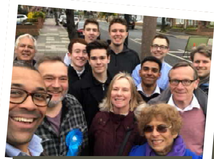
We were grateful for all the help we received to get re-elected a year ago.